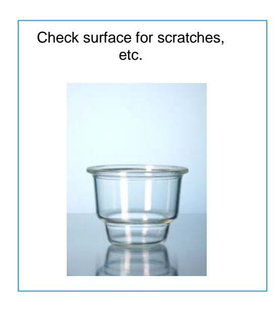
Step I Step 2